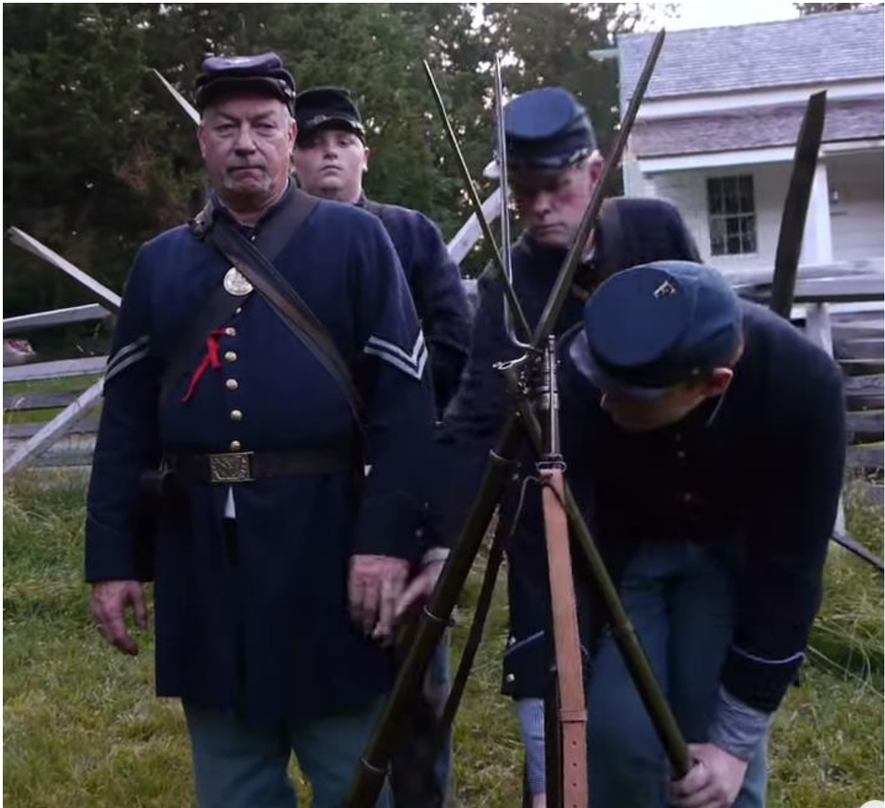
Figure 9 The command “take arms” reverses the above steps, beginning with the REAR RANK #1 soldier taking unassisted the 4 th rifle. The FRONT RANK #2 soldier puts left hand on 1 st rifle, and uses right hand to move and lift 3 rd rifle towards a horizontal position where the REAR RANK #2 soldier can grip the rifle and withdraw it from the stack. The FRONT RANK #2 soldier can then hand the 2 nd rifle to the FRONT RANK #1 soldier. Finally, the FRONT RANK #2 soldier can rotate and return the heel of the 1 st rifle to the outside of the right foot.