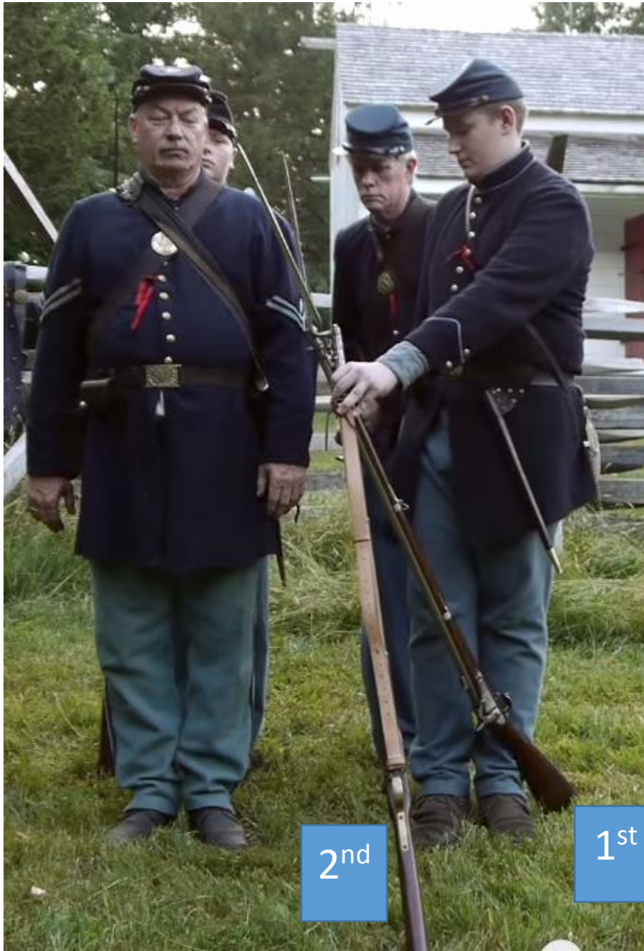
Figure 5 Front image shows the first two rifles supported with FRONT RANK #2'S left hand as they are leaned toward FRONT RANK #1 soldier.