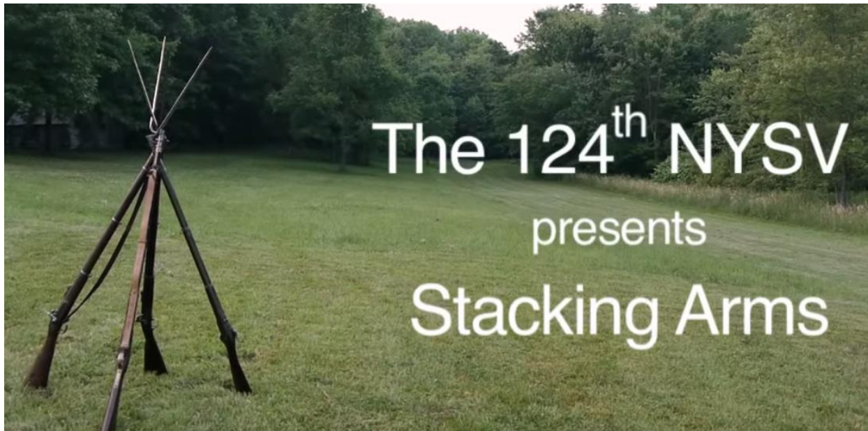
Figure 1 Stacking arms video demonstration at https://youtu.be/NBah7dVzIOw

Stacking and unstacking of arms can be accomplished smartly in a matter of seconds. Care is required to provide a rigid stack, as well as to prevent damage to the rifles and ramrods.