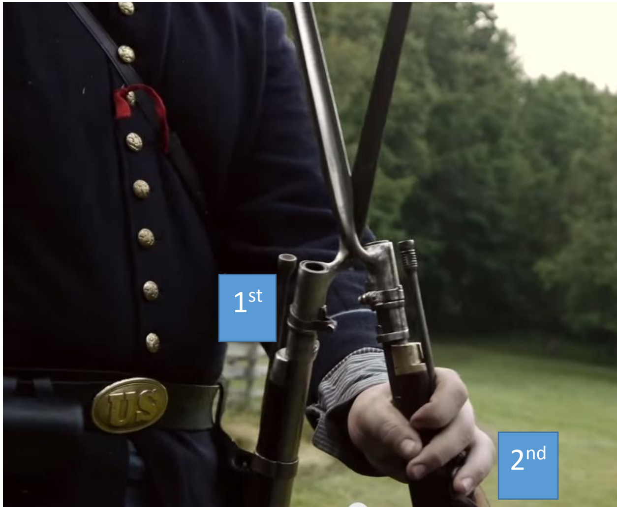
Figure 4 FRONT RANK #2 soldier then shifts left hand to rifle #2. These two rifles can now be supported with only the left hand, if they are leaned towards the FRONT RANK #1 soldier.