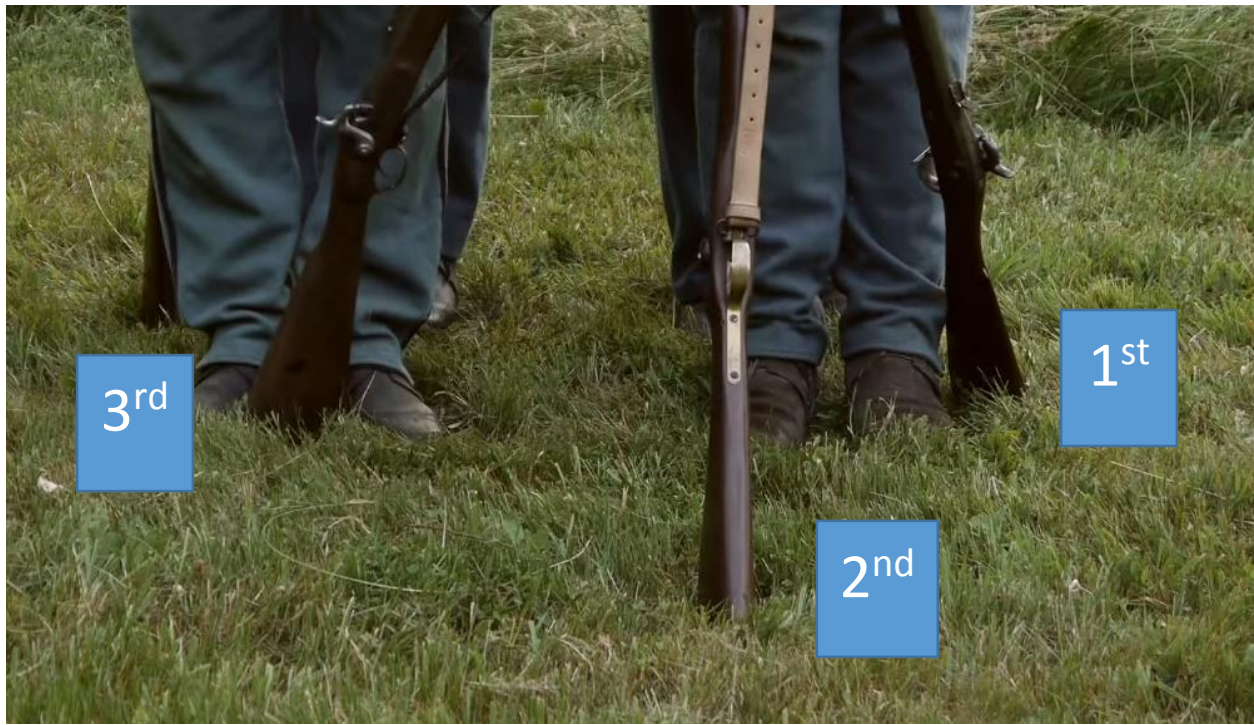
Figure 7 Front view showing the heel location of the first three rifles. This is now a rigid, self-supporting stack.