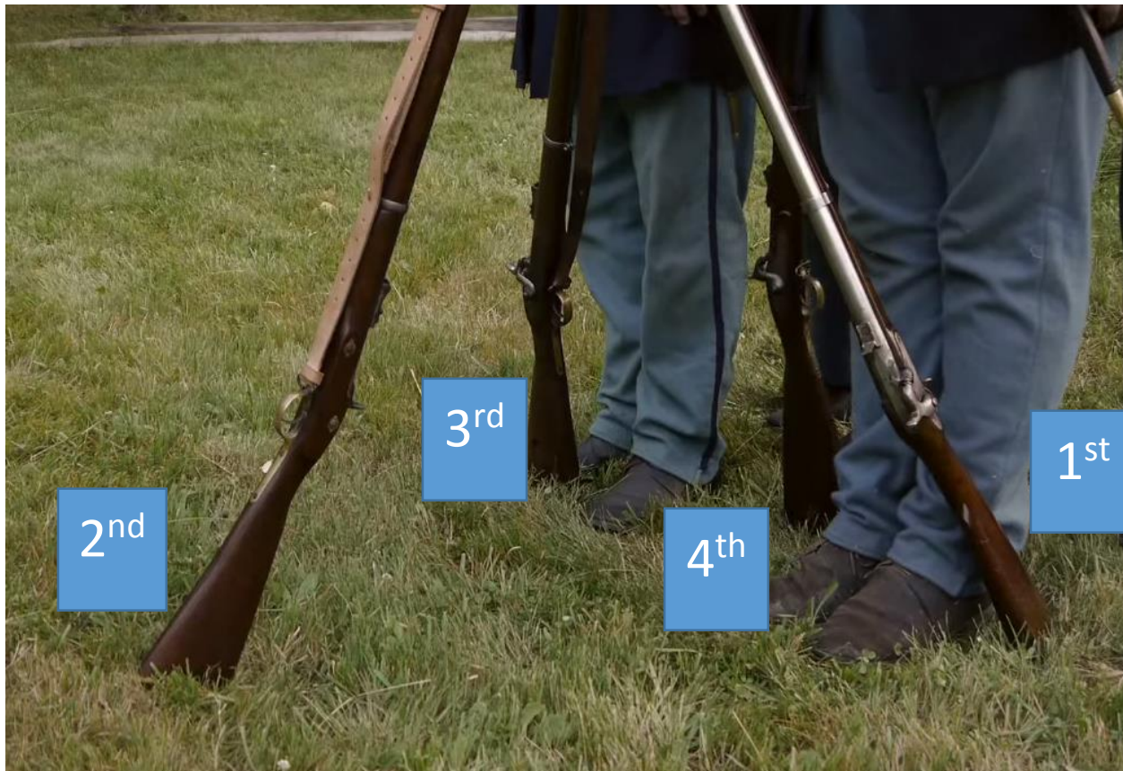
Figure 8 The REAR RANK #1 soldier leans the 4 th rifle, unassisted, against the rigid stack, placing the heel of the 4 th rifle between the feet of the front two ranks.