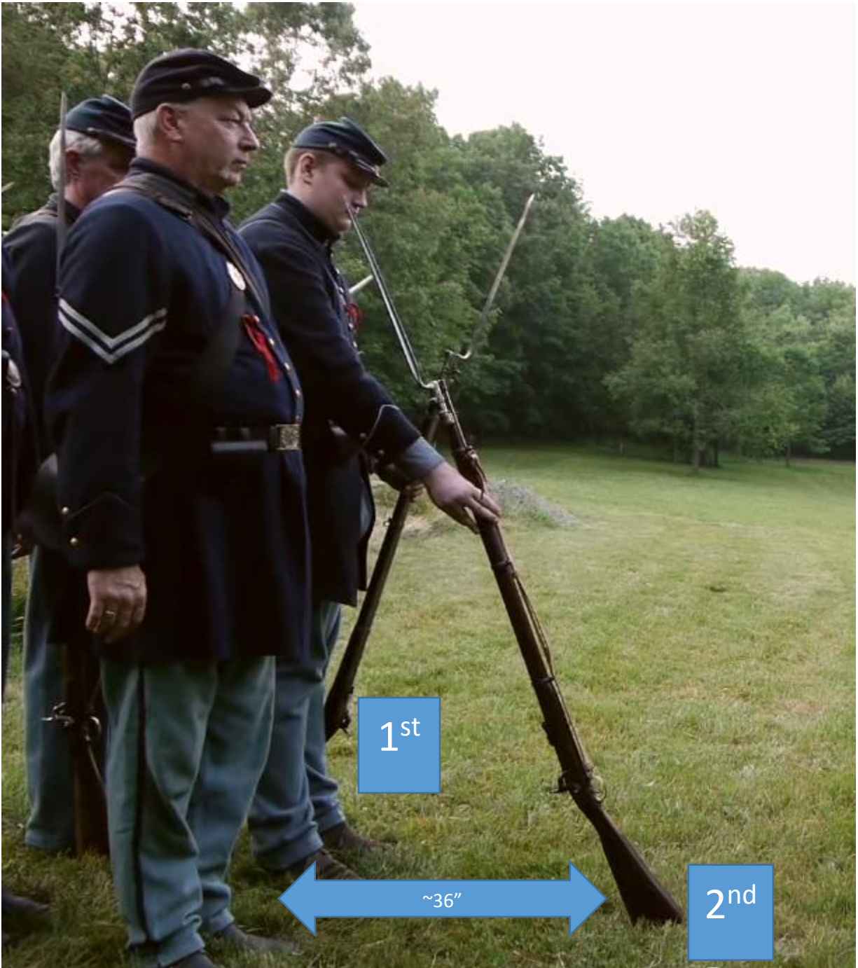
Figure 3 FRONT RANK #2 soldier rotates 1 st rifle and places heel outside of left foot, and then uses right hand to take 2 nd rifle from FRONT RANK #1 soldier. The 2 nd rifle is NOT rotated. The heel of the 2 nd rifle is placed about 36" in front of FRONT RANK #2'S left shoulder. The bayonets of the first two rifles are placed "flat to flat".