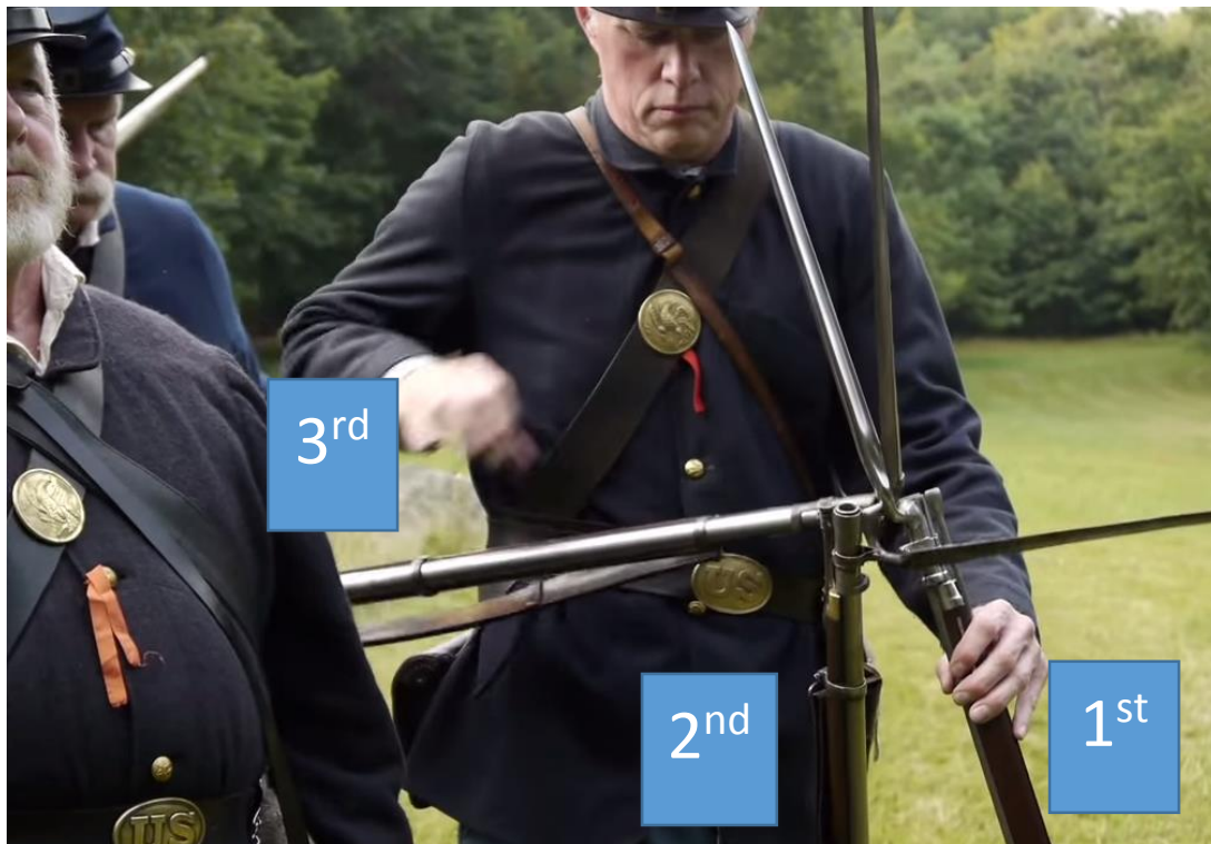
Figure 6 REAR RANK #2 soldier carefully feeds 3 rd rifle with bayonet flat side up through the bayonet opening from the first two rifle, and holds rifle #3 horizontally until FRONT RANK #2 soldier is able to take the rifle with the right hand.