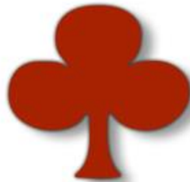
Figure 2 148 th Pennsylvania Volunteer Infantry http://148thpvi.org